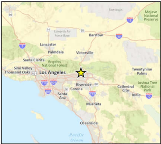
Fig. 1 Regional Location