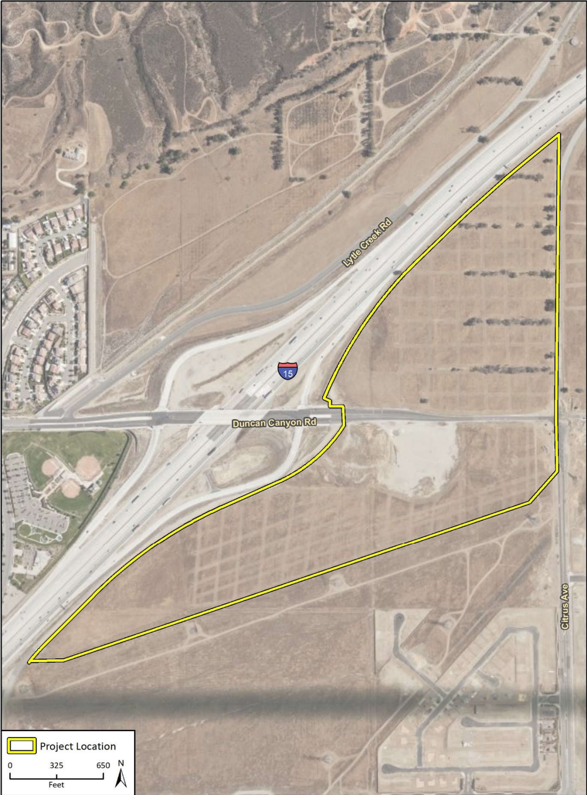
Figure 2 Vicinity Map