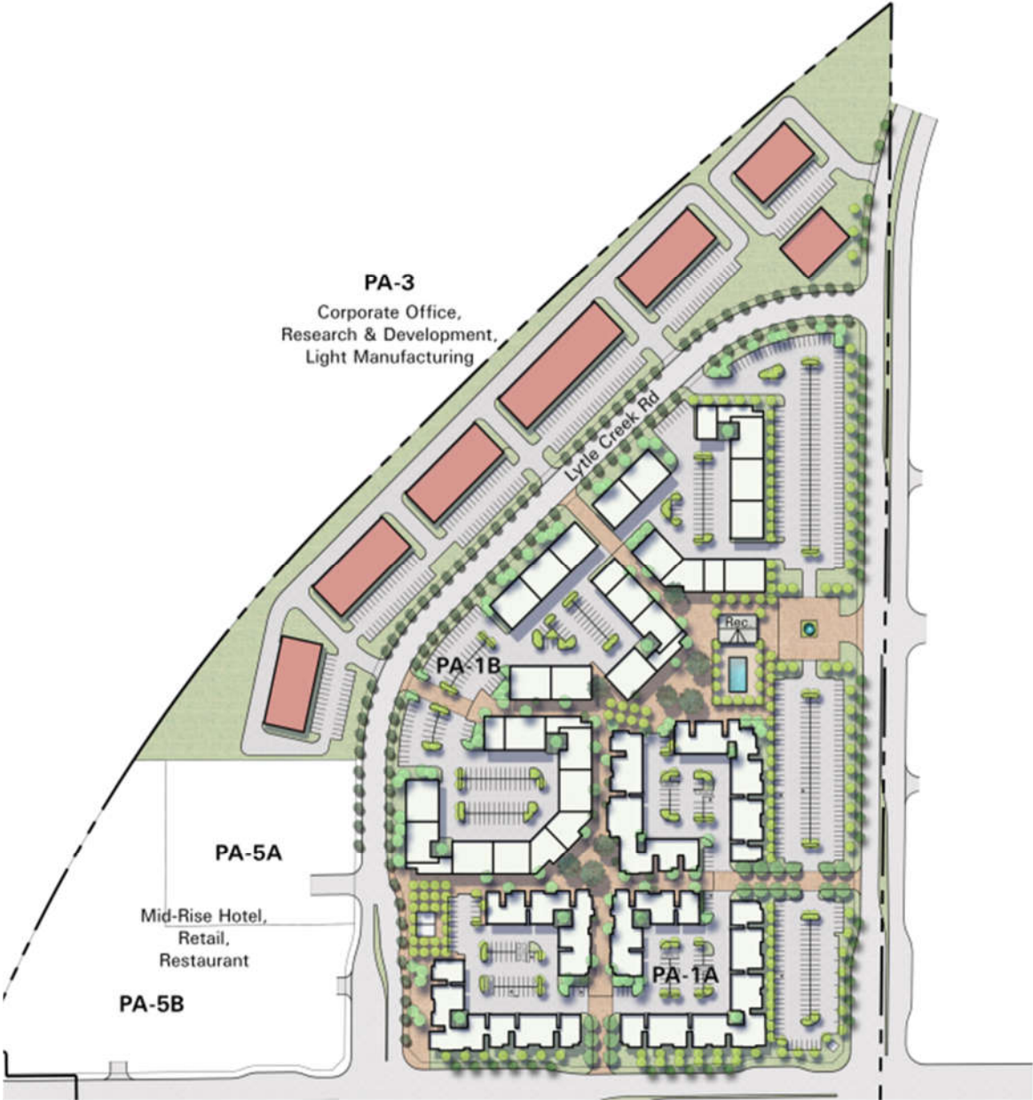
Figure 3 Conceptual Site Plan for Planning Areas 1, 3 and 5