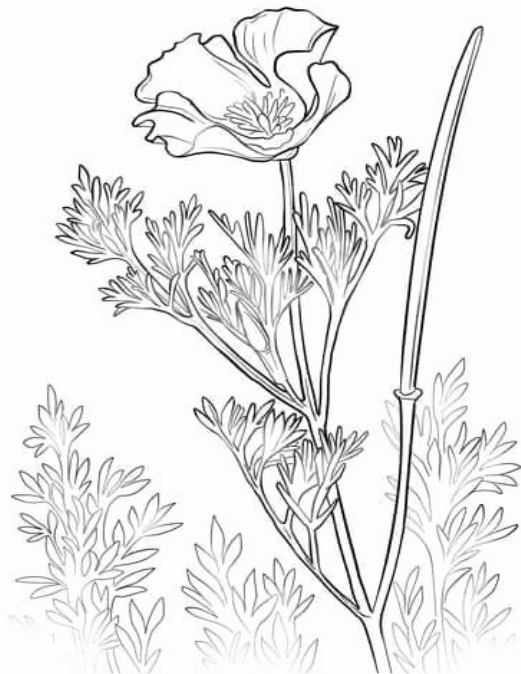
STATE FLOWER CALIFORNIA POPPY