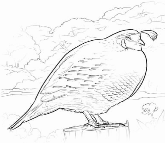
STATE BIRD CALIFORNIA QUAIL